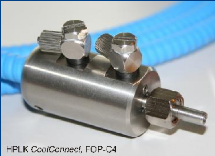
HPLK CoolConnect, FOP-C4

New miniaturized active cooled high-power laser cables for solid-state lasers and high power diode lasers